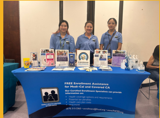
San Diego Family Health Centers