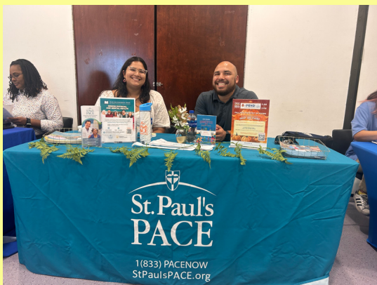
St. Paul's PACE