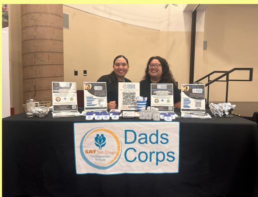
SAY San Diego (DADs Corps)