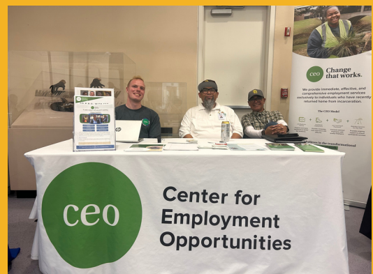
Center for Employment Opportunities