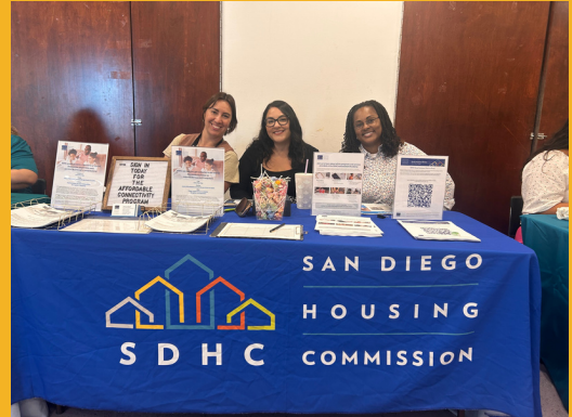
San Diego Housing Commission

SoCal is happy to share photos of the companies who attended and tabled at our third resource fair.