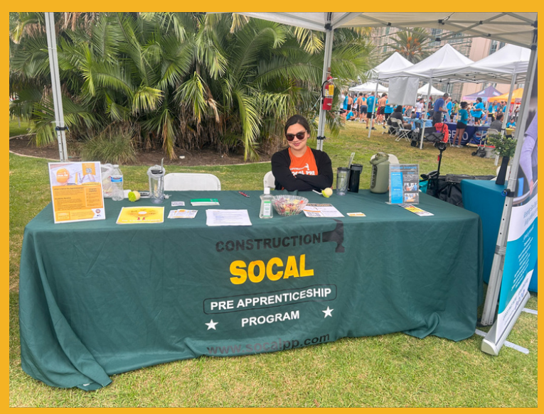
SoCal Pre Apprenticeship Program Live Well 5K Run!