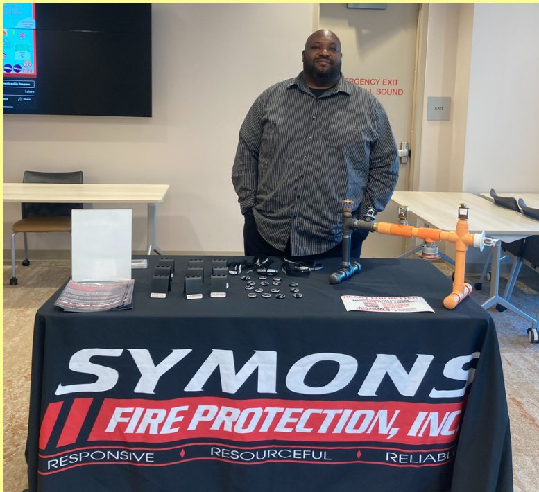
Symons Fire Protection