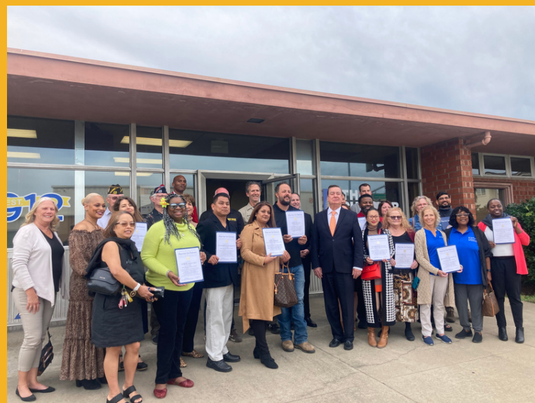
Joel Anderson Grant Award Ceremony