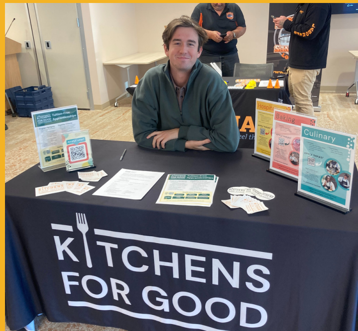
Kitchens For Good