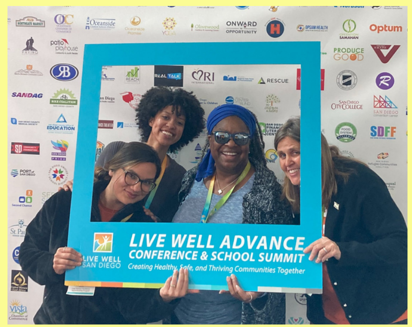
San Diego Live Well Advance Conference and School Summit