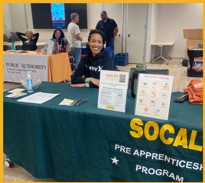
SoCal Pre Apprenticeship Program